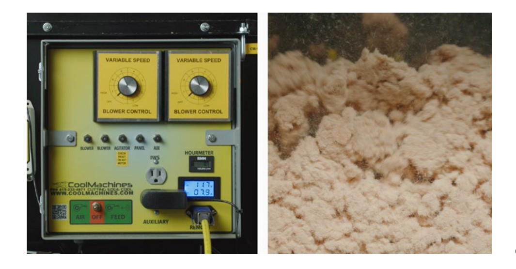
Machine adjustments help optimize yield