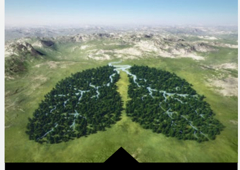
脊 Healthy Planet

A comprehensive, above-grade product line to create wind-tight, vapor-open assemblies offering stable, long-term R-values, improved temperature stability, and premium sound protection